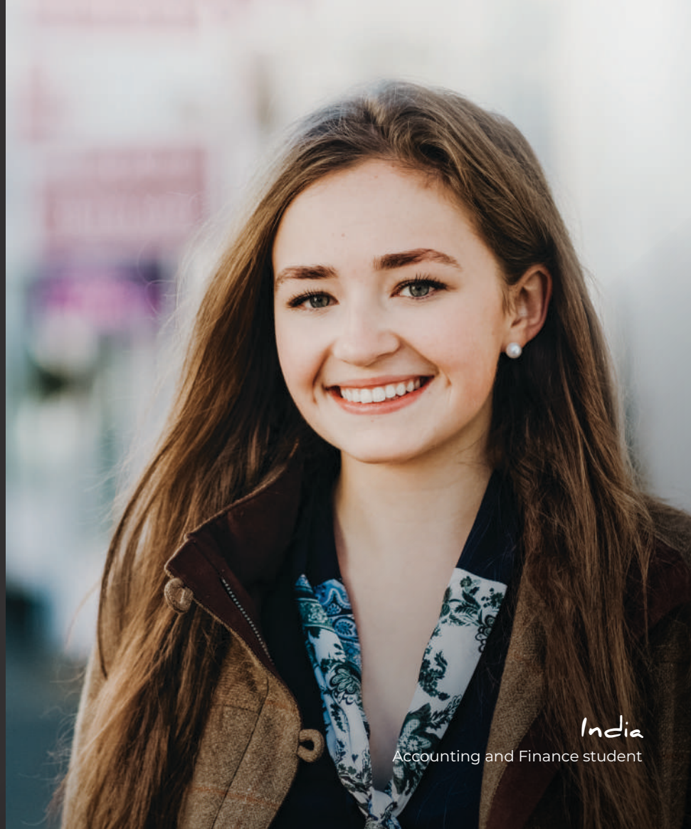
India Accounting and Finance student

We keep class sizes small so you won't get lost in the crowd. You will be assigned a personal tutor to support you every step of the way, and our academic and student support teams will ensure you have the tools to succeed in your studies. We value the quality of your learning experience.